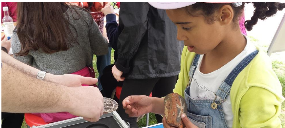
Child handling objects from Reading Abbey at the 'Forbury Fiesta'.

Have you enjoyed a 'virtual reality' view of the Abbey Ruins or held a 900 year-old tile from Reading Abbey? There's still time to take part in these experiences and more as the project's 'Abbey on Wheels' outreach programme rolls on.