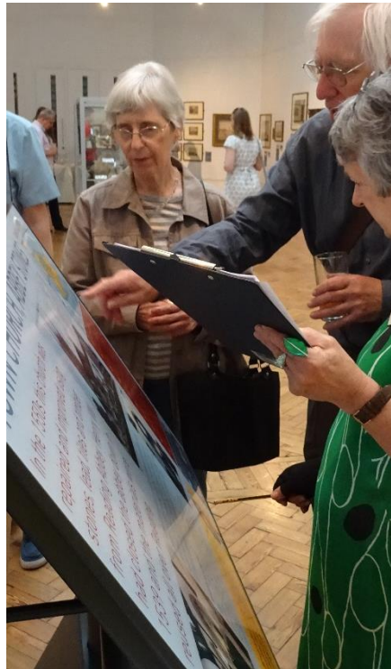
Visitors give feedback on the prototype panel in our current exhibition.

We'd love to hear your views on this prototype interpretation panel during this period, so either drop by and visit the exhibition at Reading Museum or catch us by St. Mary's Church next month!