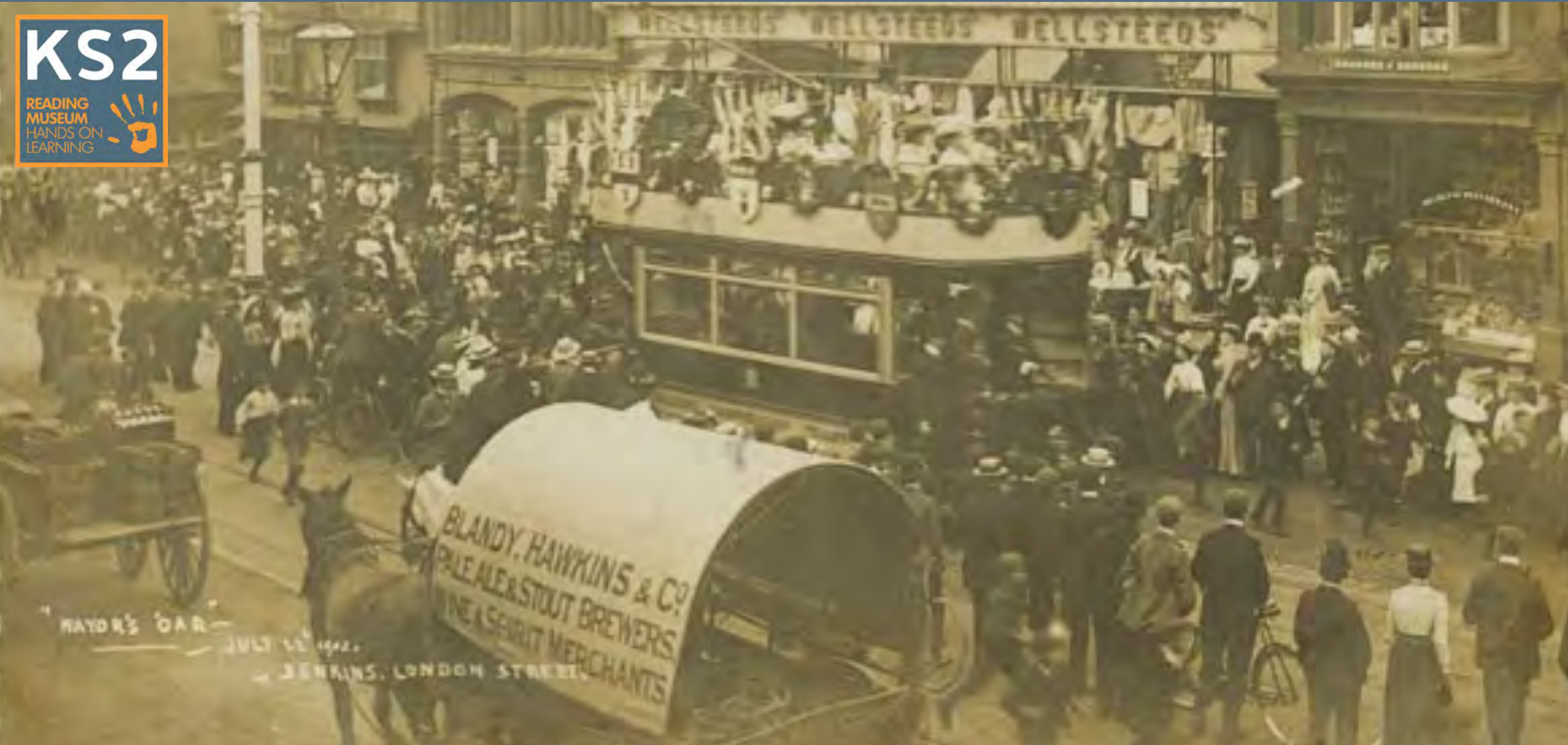
"MAYOR'S OAR" JULY 12 1912. JENKINS, LONDON STREET.